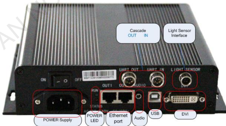
Fig. 2 Interface diagram